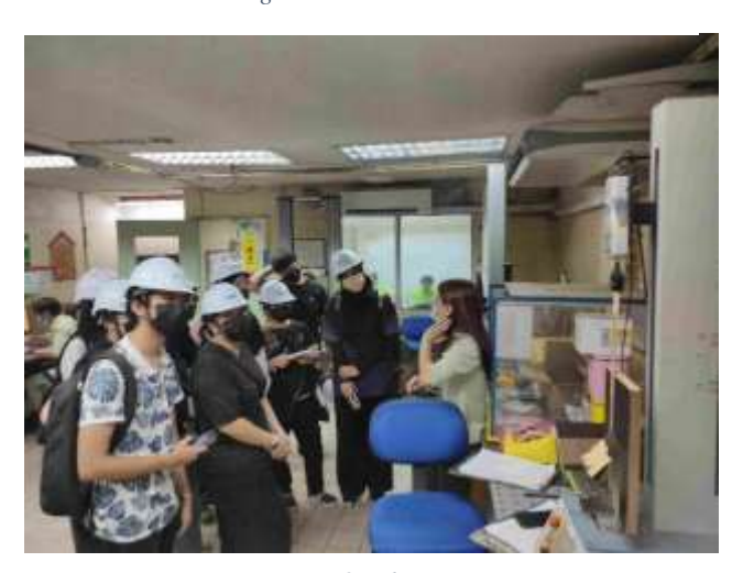
Figure 8 Laboratory