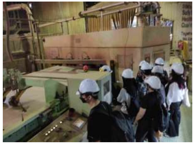
Figure 7 CPS