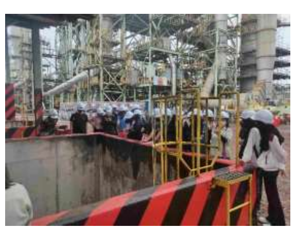
Figure 3 Chip Bin