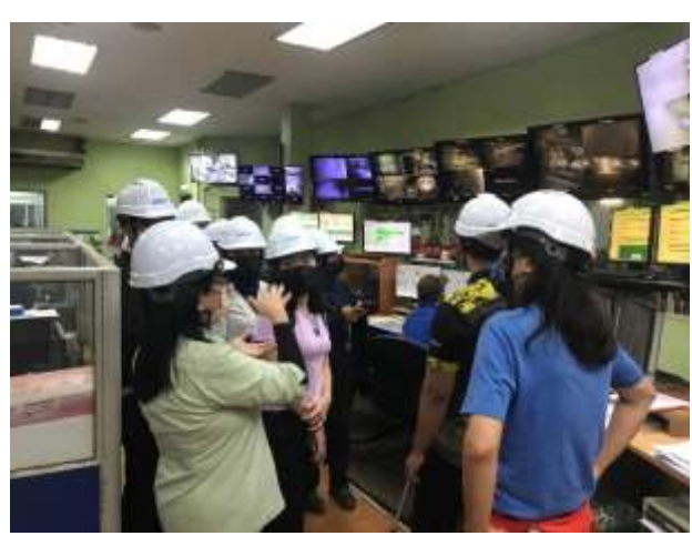
Figure 6 Control Room